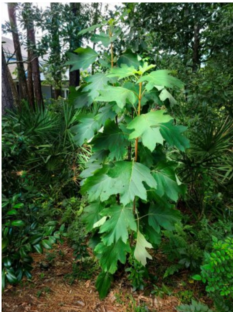
Native Oakleaf Hydrangea

Mary Lib : The garden is mature, but Alan and I continue to change, replace, or add shrubs. When we visit nurseries, which is fairly often, we'll pick up a plant or two that catches our fancy. Alan loves to visit the bargain and sale areas for a good deal!