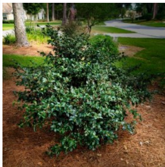
Camellia susanqua - 'Yuletide'