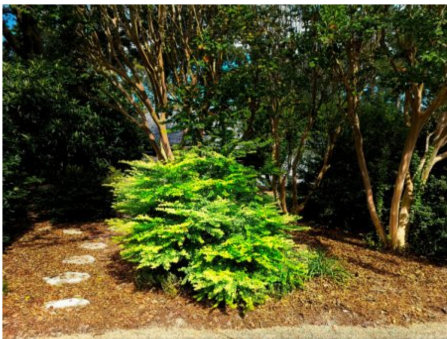
Sunshine ligustrum allowed to grow naturally