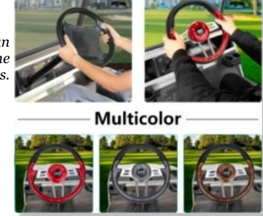
2. Steering wheel replacement is a cool feature that can differentiate your cart and make it stand out amongst the crowd. They come in a variety of styles and colors.

1. Mirrors are an essential part of the cart or your vehicle so every golf cart should have a pair of mirrors.