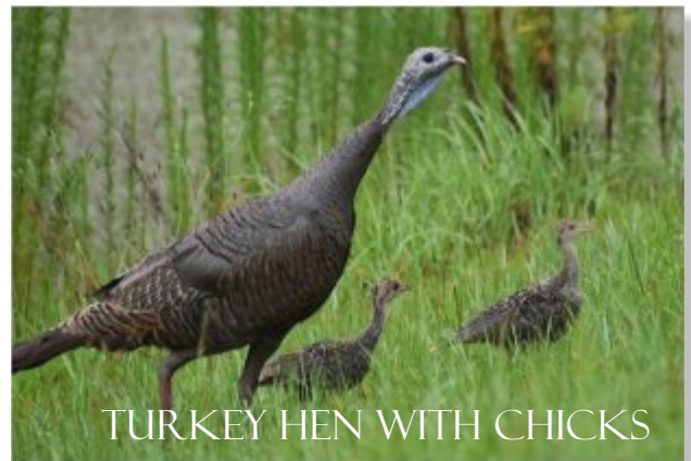
TURKEY HEN WITH CHICKS

Turkeys are extremely difficult to photograph. They usually run straight for the brush before I can react. I hid behind a tree and was able to watch mom and dad take the little ones out for breakfast. (Pond by Blackstone.)